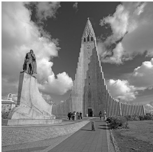
Leifur Eiríksson statue and Hallgrímskirkja church in Reykjavík.