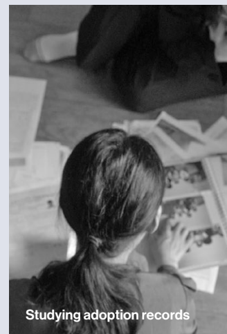
Studying adoption records