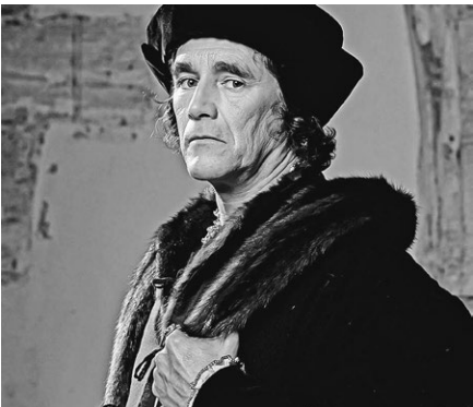
Mark Rylance plays Thomas Cromwell