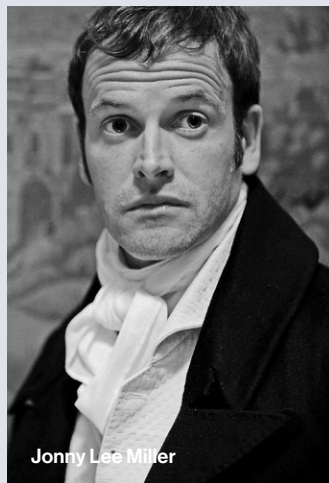
Jonny Lee Miller