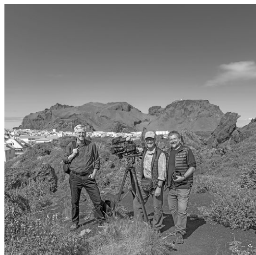
Rick Steves and crew in Iceland.

This interview has been condensed and edited for clarity.