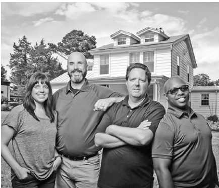
The Legacy List team

Watch on WTTW Create, wttw.com/watch , or the PBS app.