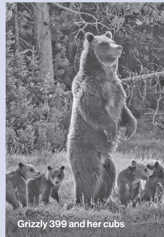
Grizzly 399 and her cubs