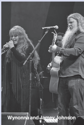
Wynonna and Jamey Johnson