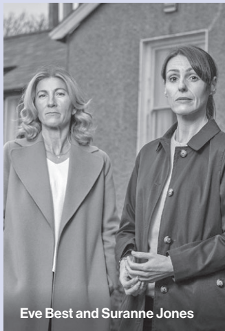
Eve Best and Suranne Jones