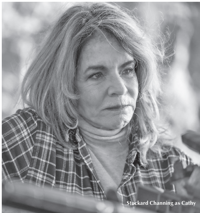
Stockard Channing as Cathy

These interviews were edited for length and clarity, and are courtesy of Masterpiece.