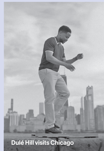
Dulé Hill visits Chicago