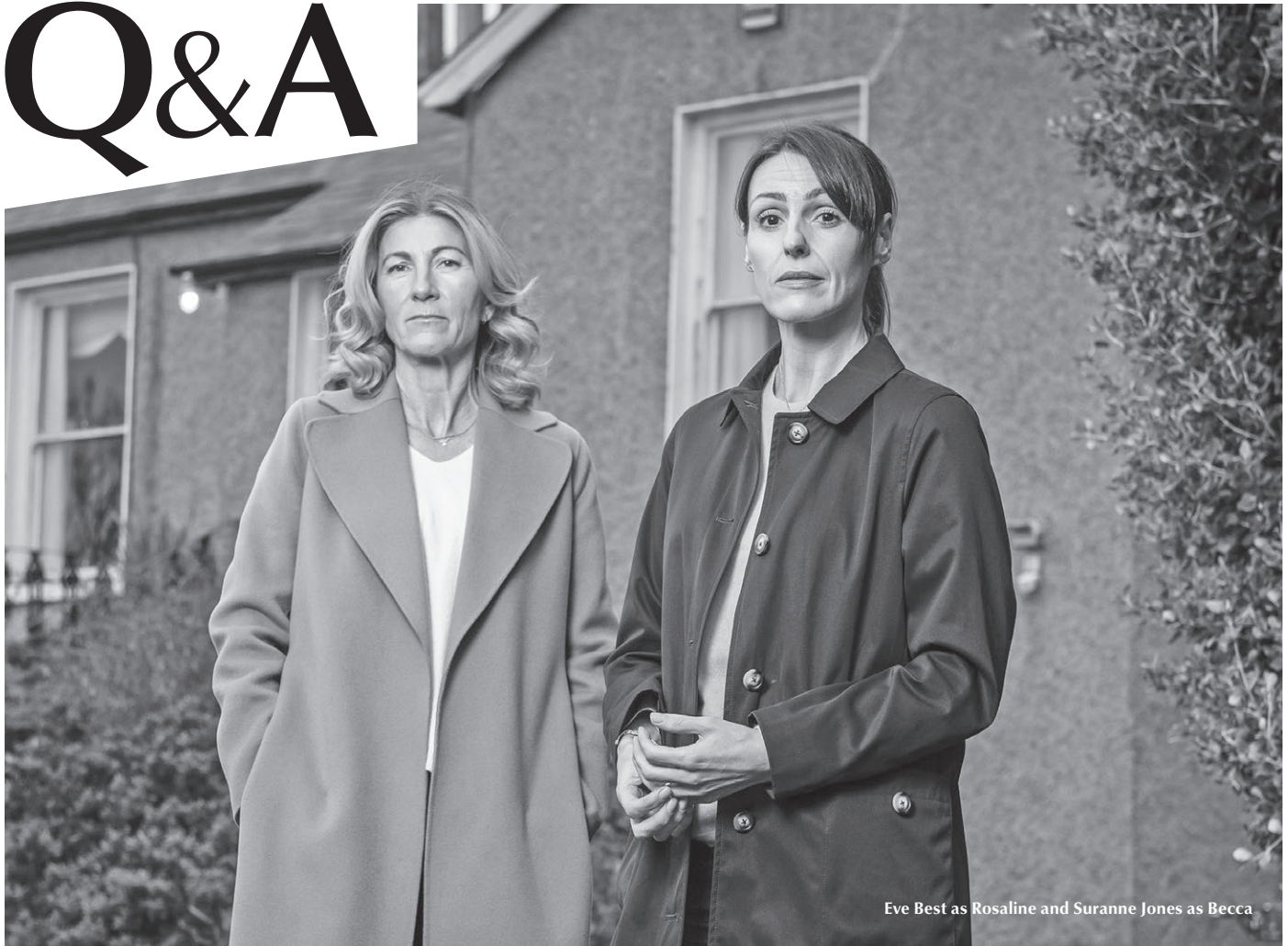
Eve Best as Rosaline and Suranne Jones as Becca