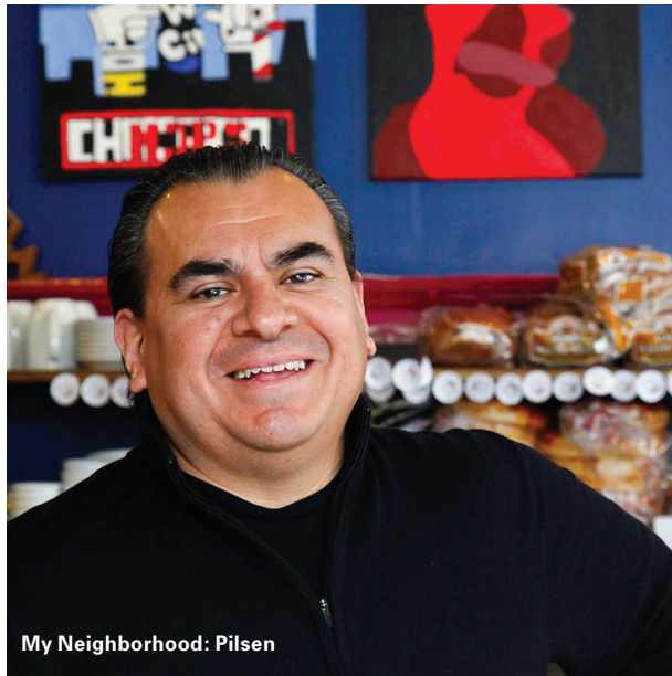
My Neighborhood: Pilsen