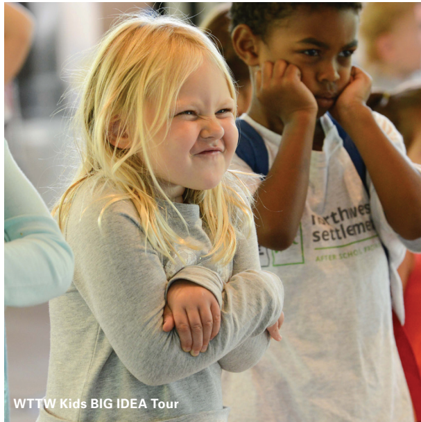
WTTW Kids BIG IDEA Tour

Thousands of adults, children, parents, seniors, and caregivers were directly impacted by our public outreach events, which promoted healthy eating, exercise, literacy, school readiness, the value of higher education, family connections, and an informed citizenry, and enhanced knowledge of, and an appreciation for, the rich and diverse community in which we live and work. Audiences were kept engaged and informed on wttw.com, on Facebook, and on Twitter.