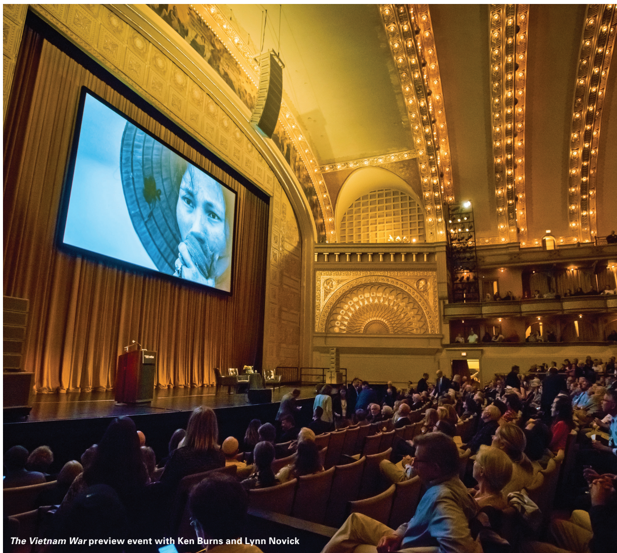
The Vietnam War preview event with Ken Burns and Lynn Novick

WTTW , which marked 62 years on the air in 2017, is a premier public media organization committed to creating and presenting unique television and digital media content across four distinct television channels – WTTW11, WTTW Prime, WTTW Create/WTTW WORLD, and WTTW PBS Kids – and on wttw.com . Recognized for award-winning local and national productions such as Chicago Tonight , Check, Please! , Nature Cat , Soundstage , and Mexico – One Plate at a Time , WTTW presents the very best in public affairs, arts and culture, nature and science, history and documentary, and children's programming. Visitors to WTTW.com can access a full library of video content for kids and adults, immersive web-exclusive stories and features, event and membership opportunities, and more. Audiences can connect with WTTW on Facebook, Twitter, and YouTube.