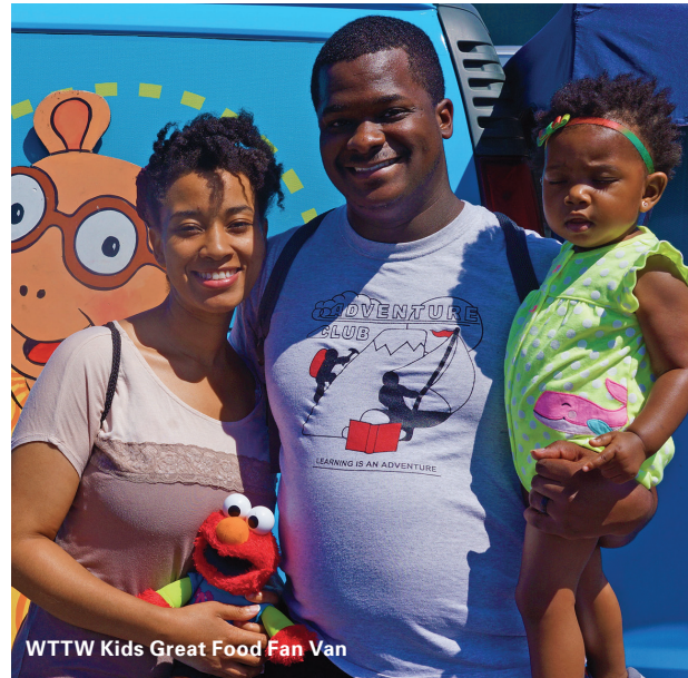
WTTW Kids Great Food Fan Van